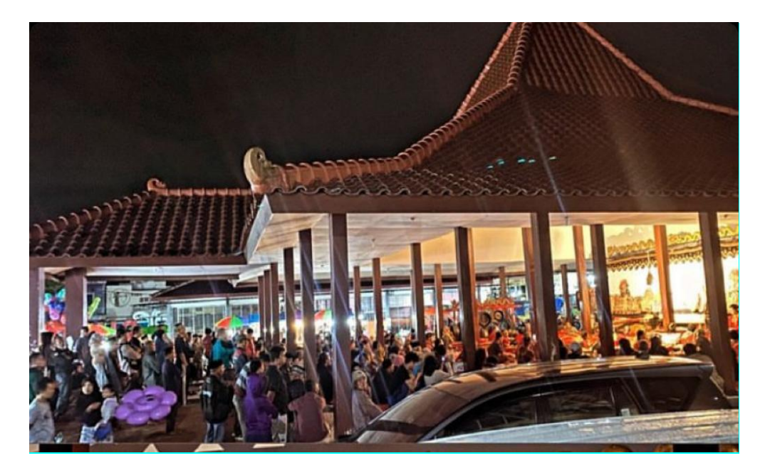
Figure 8. Art performances in the pavilion of Sanggar Pendopo ARH