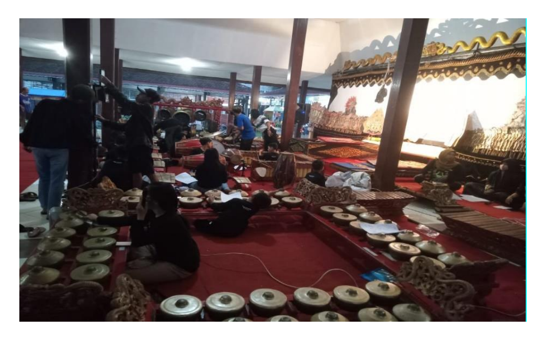
Figure 5. Preparation for wayang performance (puppet show).