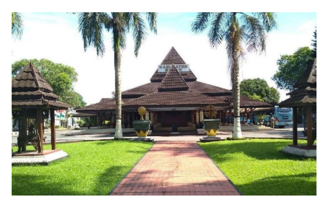
Figure 1. Pendopo Agung Ronggo Hadinegoro – front view.