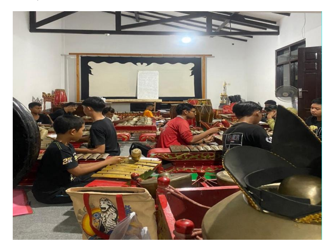
Figure 6. Training for young artist trainees.