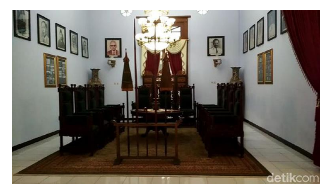
Figure 2. Room for storing weapon relics and cultural relics.