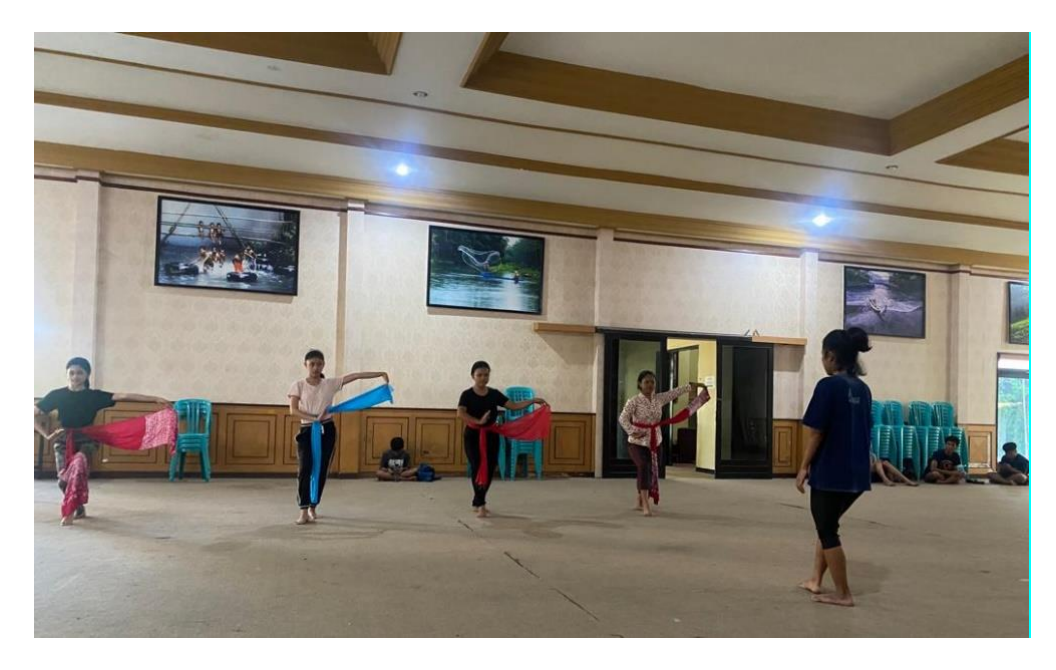
Figure 7. Studio as a place of practice and training.

Through Cultural Promotion. Efforts to preserve cultural heritage may also involve activities designed to attract tourists interested in the culture. To facilitate this promotional activity, studios are equipped with the necessary resources to stage performances both domestically (within the region) and internationally. Furthermore, cultural introduction activities are conducted through cultural exchanges with universities in other countries, one of which is the University of California, Los Angeles (UCLA), located in the United States. This cultural exchange is facilitated by providing financial support to the artists from Sanggar Pendopo ARH, enabling them to carry out cultural exchange activities in other countries. These activities include serving as art trainers and holding art performances in front of students and the general public in the respective countries. The purpose of this event is to familiarise members of foreign communities with the art and culture of the host community. In addition to promotion in foreign countries, promotion is also carried out in the domestic region, other regions, and even other countries by participating in cultural festivals and joining art competitions.