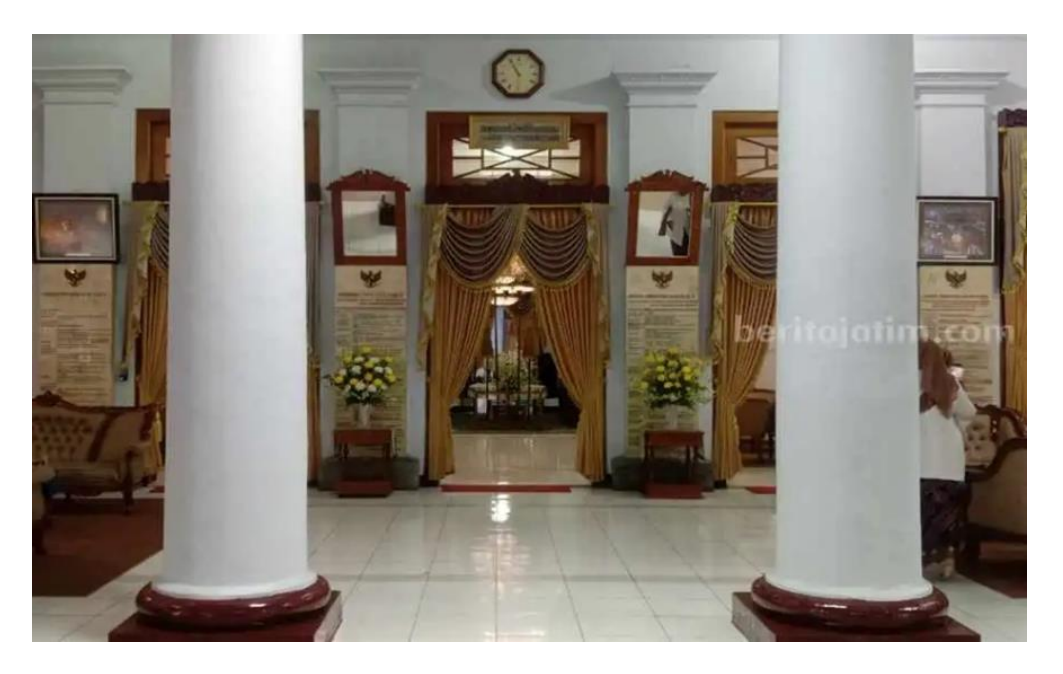
Figure 3. Inscription on the wall in the pavilion.