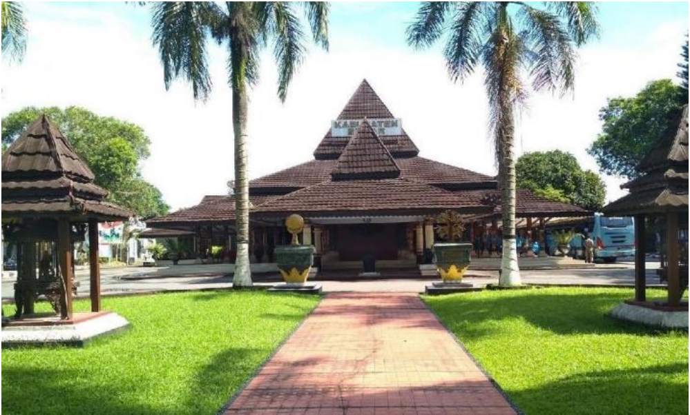
Figure 1. Pendopo Agung Ronggo Hadinegoro – front view.