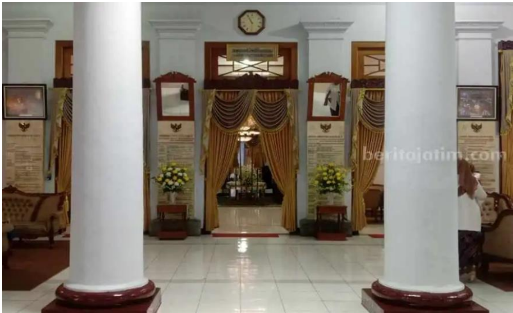
Figure 3. Inscription on the wall in the pavilion.