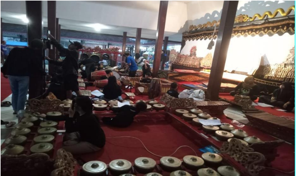
Figure 5. Preparation for wayang performance (puppet show).