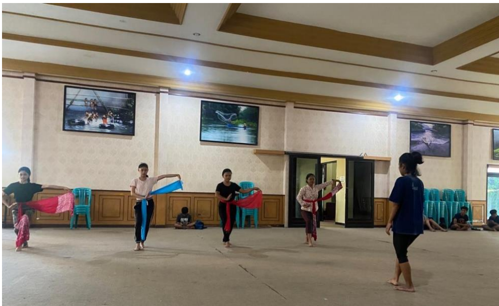
Figure 7. Studio as a place of practice and training.

Through Cultural Promotion. Efforts to preserve cultural heritage may also involve activities designed to attract tourists interested in the culture. To facilitate this promotional activity, studios are equipped with the necessary resources to stage performances both domestically (within the region) and internationally. Furthermore, cultural introduction activities are conducted through cultural exchanges with universities in other countries, one of which is the University of California, Los Angeles (UCLA), located in the United States. This cultural exchange is facilitated by providing financial support to the artists from Sanggar Pendopo ARH, enabling them to carry out cultural exchange activities in other countries. These activities include serving as art trainers and holding art performances in front of students and the general public in the respective countries. The purpose of this event is to familiarise members of foreign communities with the art and culture of the host community. In addition to promotion in foreign countries, promotion is also carried out in the domestic region, other regions, and even other countries by participating in cultural festivals and joining art competitions.