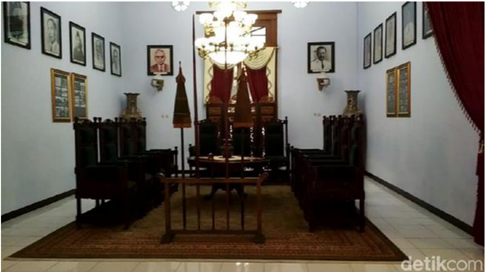
Figure 2. Room for storing weapon relics and cultural relics.