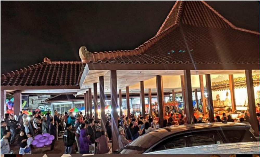
Figure 8. Art performances in the pavilion of Sanggar Pendopo ARH