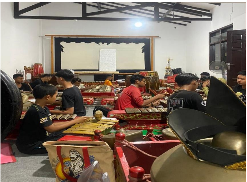
Figure 6. Training for young artist trainees.