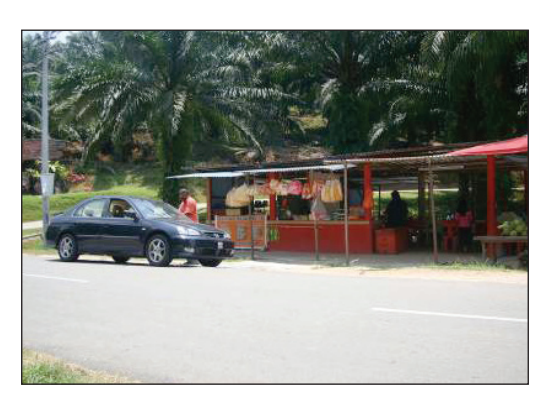
Photo 2 A stall at the entrance to the Hot Spring Recreational Park of Sungai Klah

Sungai Klah there are several food stalls along the main access road developed by locals to take advantage of the positive effects of tourism development in their area. Unfortunately, the stalls attract only a small number of customers. (Photo 2).