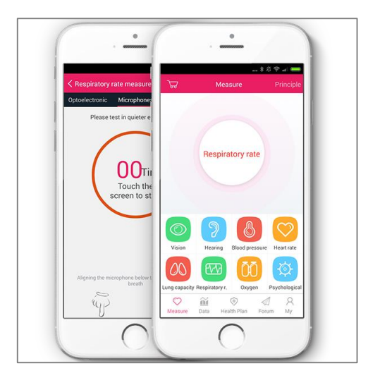
Figure 2. iCare respiratory rate app.

Pitch Range. Pitch range was measured individually to determine the lowest and the highest pitch a participant could reach. PwP tend to speak in monotone with a decreased pitch range thus affecting the quality of their speech, hence it is important to understand the issues by grasping their baseline pitch ranges and to further drafting rehabilitation plan to expand their pitch range. Participants were asked to sing a set of researcher's created vocalises (see Figure 3, Figure 4, Figure 5, and Figure 6) and each vocalise was played on a music keyboard to accompany participants and assessed by the researcher. Both the highest (max) and lowest (min) pitches were recorded according to musical notation and then translated to frequency (Hz) when analyzing data.