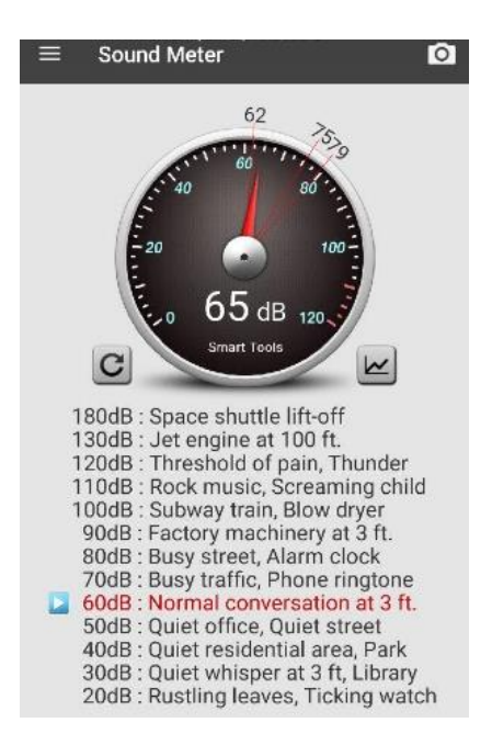
Figure 1. An example of acoustic data through 'Sound Meter' app.

of sound level could be detected during a same measurement time. Figure 1 shows a sample of data, it can be clearly seen that the min score (softest voice) and max score (loudest voice) in a reading session were obtained, in which the min=62dB and max = 79 dB.