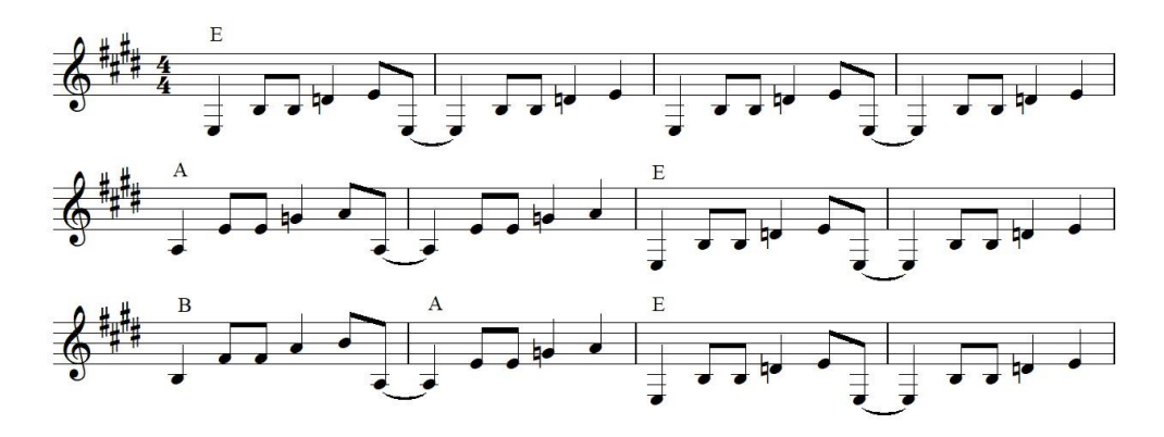
Figure 2 'What'd I Say' (Charles, 1959, transcribed by Author)

Using Fisher's justification of tunes in place of exercises it is argued that 'What'd I Say' has the same pedagogical function as the exercise, however, presents it in a more aesthetically pleasing manner for the student and is therefore of more pedagogical value. This process was utilised to examine the content of the highest ranking twenty tunes from each data source. Other publications used for cross referencing purposes include Complete Method for Modern Guitar (Bay, 1948), Be Dangerous on Rock Guitar (Daniels, 1986), Hal Leonard Guitar Method (Schmidt, 1977), A Modern Method for Guitar (Leavitt, 1966), Complete Course in Jazz Guitar (Baker, 1955) and Progressive Rhythm Guitar (Turner & White, 1979b). These publications were chosen due to their status within the Australian guitar community and their historical significance with the wider global guitar community. Another consideration in the determination of each song's pedagogical value was skills transferability. Tunes which contained content that was relevant for a high