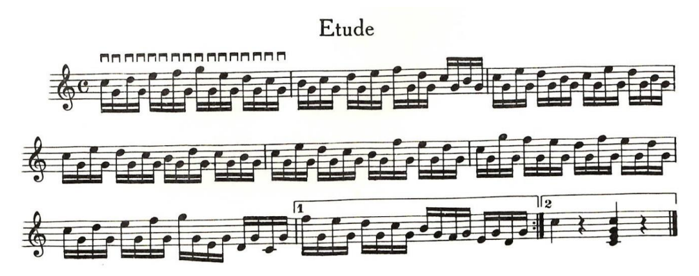
Figure 5. 'Etude' - Mel Bay (Bay, 1948, p. 39)

These two examples, together with examinations of earlier blues compositions, including John Lee Hooker's 'Boom Boom' in back to back comparison with 'Back in Black', do not show any musically annotatable content of distinct Australian cultural origin being added to the global guitar pedagogy by AC/DC. This may suggest that at the time, there was nothing unique, from an international perspective, within the Australian electric guitar culture. The study found that Australian rock and roll guitar culture is a hybrid of the corresponding American and British cultures. There were some unique Australian inventions found within the paradigm of this study, but none were significant enough to manifest in the canon using the methodology chosen.