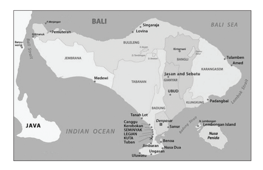
Figure 1 Map of Bali's districts and regencies including the lower highland communities of Jasan and Sebatu.

I first contacted the village head of Jasan in 2002, while conducting research for my doctoral dissertation on regional variants of gamelan gong gede , Bali's largest ritual orchestra consisting of vertically and horizontally suspended knobbed bronze gongs, drums and percussion (Hood 2010). The village head or kepala dusun Jasan at that time was senior musician and community leader I Nyoman Meranggi (see Figure 2).