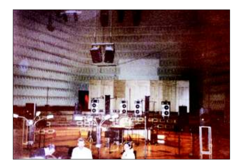
Figure 2 The Acousmonium in 2008.