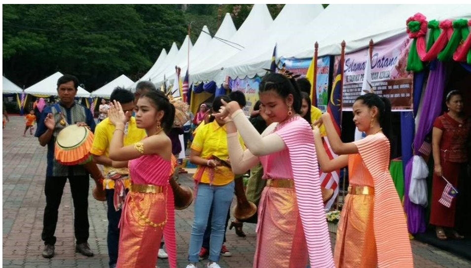
Figure 4. Dancing and playing the klong yao at Merdeka Day 2016

Malays also acknowledge klong yao as representing Thai culture of the Siamese communities by allowing a performance during the celebration of Merdeka Day. Every year on 31 August, officially proclaimed as Merdeka Day, all Malaysians celebrate Malaysia's independence from the colonial British, (see Figure 4 below). The Siamese have long been known as people residing at the northernmost area of the Malaysian peninsular. They are also members of the Malaysian nation and treated as bumiputera according to the applicable law. The Siamese have never denied they are Siamese Malaysians in the midst of the development of a Malaysian image and presenting a Siamese identity. They use the klong yao to promote Thai performances of tradition and culture. The dance movements harmonised with the rhythm of the klong yao distinguish them from other ethnic groups. Merdeka Day lets the performers to openly exhibit Siamese cultural heritage.