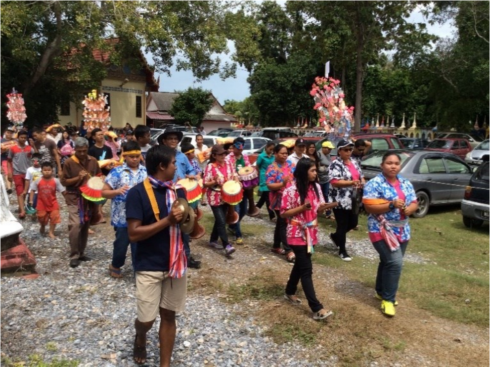
Figure 3. Klong yao in Tod Krathin ceremony, Macchimaprasit Temple 2016

as an essential part of the religious ceremony that took place in the Buddhist temples.