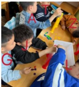
Figure G (Case 5)