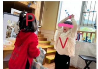
Figure I (Case 6)

In Case 6, Child P and Child V could not agree on who would play the next game until the teacher intervened (Fig. 11). Observed that the teacher used the guessing game to stop Child P and Child V from arguing, but she did not solve the problem. Instead of deciding the winner of the guessing game, the teacher should have taught the children the rules, turn-taking, and fairness. The researcher strongly believes that teachers' perceptions of the rationality and value of peer conflict in young children are the basis and foundation for teachers' resolution of peer conflict, and that affirming the value and rationality of conflict is the right philosophy for peer conflict. Teachers' beliefs on social behavior during peer play will affect how they handle the