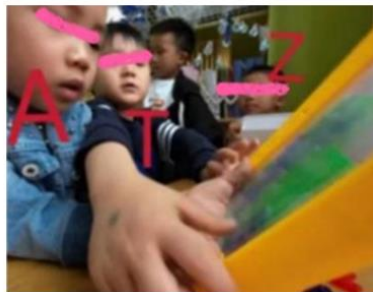
Figure H (Case 5)