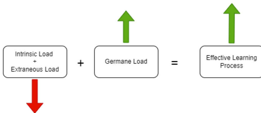
Figure 1: The illustration of the relationship between IL, EL, and GL and the effectiveness of the learning process

Furthermore, the germane load is a strain that appears while managing and building mental structures (Mutlu-Bayraktar et al., 2019). Since it results from student exertion, it is a type of "good" load that has consequences for students' progress (Albus et al., 2021). The influence of an immersive environment could make using VR more motivating Kavanagh et al (2017) to accomplish the task. By bridging the gap between instructional information and student motivation, VR has the potential to improve medical education. In other words, if students feel more motivated, they will exert more effort to complete more assignments. These findings lead to the conclusion that apps with lower EL and IL and higher GL lighten the cognitive load and improve learning efficiency.