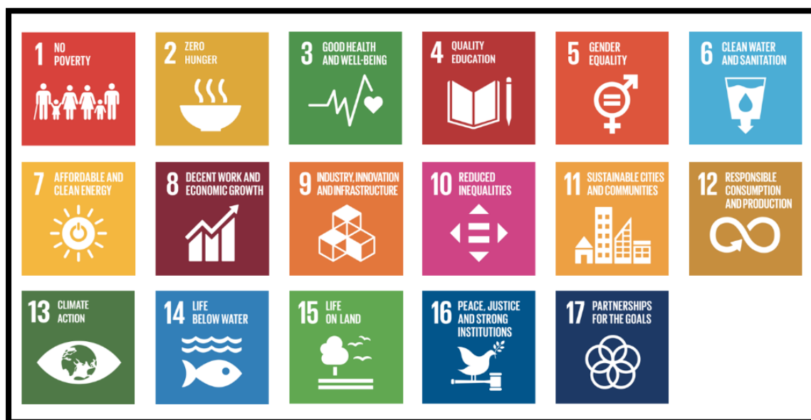
Figure 1. Seventeen Goals of Sustainable Development Goals (SDGs)

economical and social aspects. The SDGs contain 17 goals and 169 SDG targets which aim to overcome the various and complex problems faced by humans (Pradhan et al., 2017). The SDGs are also the focus of the United Nations Development Program (UN) for the period between 2015 to 2030 which integrates, unites and balances the three dimensions of sustainable development (SD) which includes areas in economics, social and environmental as shown in figure 1.0.