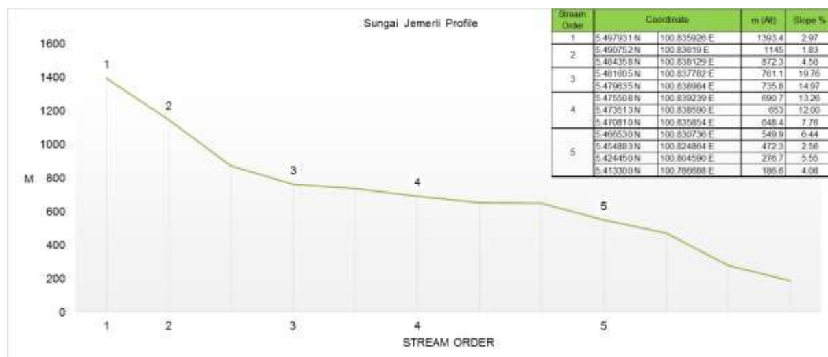
Figure 2 Sungai Jemerli sub watershed profile from order 1 to order 5, with coordinates with altitude (m) and slope percentage (Insert table)

L_{SM} at a drainage relate to the surface of the plains (Strahler, 1964). To obtain L_{sm} , stream lengths divided by stream order. The L_{SM} of the first order is 431.0 m (0.43 km), the second order is 584.63 m (0.58 km), third order is 1,802.48 m (1.8 km), the fourth order is 1,622.09 m (1.6 km) and the fifth order is 11,968.52 m (12 km). The gradient of the stream can be seen from the length of a stream (Singh & Gou, 1997), in this study, found the steep slope are at first order following second order, third order, then fourth order and the less steep is a fifth order (Figure 2).