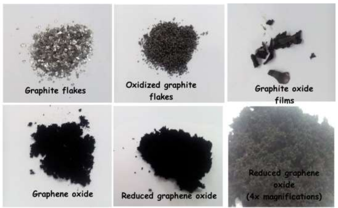
Figure 2 Photographic images of graphitic carbon materials