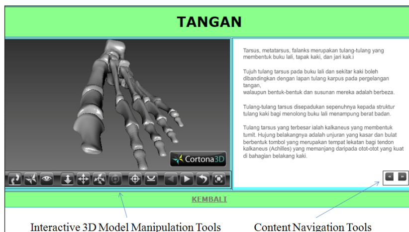
Figure 3 Multimedia Message Design

The development of this 3D visualization tool was based on the web virtual reality technology. The web virtual reality technology is a set of low cost virtual reality technologies that enables the developer to build a web VR application. In this project, HTML, CSS and VRML programming language were used as the core technology. Autodesk 3D Studio Max was used for developing 3D anatomy structure. Graphic elements, such as buttons and illustrations, were developed using the graphic editor software GIMP. The development process consisted of three important steps, namely the development of a 3D anatomy model, the development of a VRML file, and the development of the web VR application. The 3D designer was employed to develop a three dimensional anatomy model. The development of the 3D anatomy models was carried out under the supervision of the science teachers. This supervision was vital to help minimise the development time and to ensure accurate 3D models.