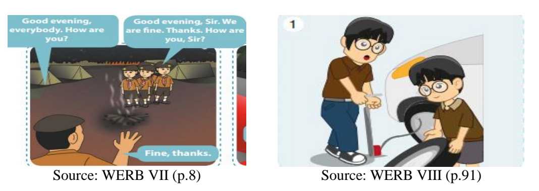
Figure 1b: Male Gender Bias Depicted in Images and Dialogues