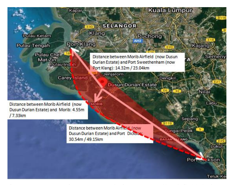
Figure 1: Coverage area for Japanese air force at Morib Airfield during World War II

In the World War II, Japanese forces attacked Malaya in December 1941. By February 15, 1942, they occupied the entire Malaya and Singapore. During the occupation, as part of their military logistics, the Japanese built an airstrip at Morib for air force support to cover the perimeter from Port Swettenham (Port Klang) to Port kwas 49.39 miles or 79.52 kilometers (Morib Airfield - Port Swettenham: 14.32 miles / 23.04km; Morib Airfield - Port Dickson: 30.54 miles / 49.15km; Morib Airfield - Morib town: 4.55 miles / 7.33km) with approximately 102.06 miles square feet / 264.57km square feet.