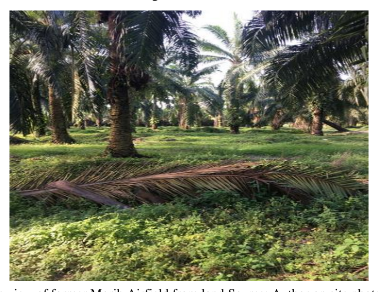
Figure 5: The view of former Morib Airfield from land