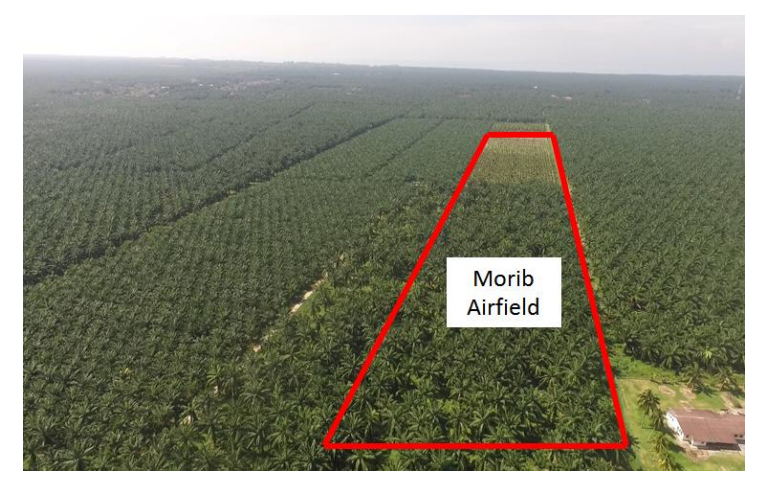
Figure 4: The view of former Morib Airfield from air