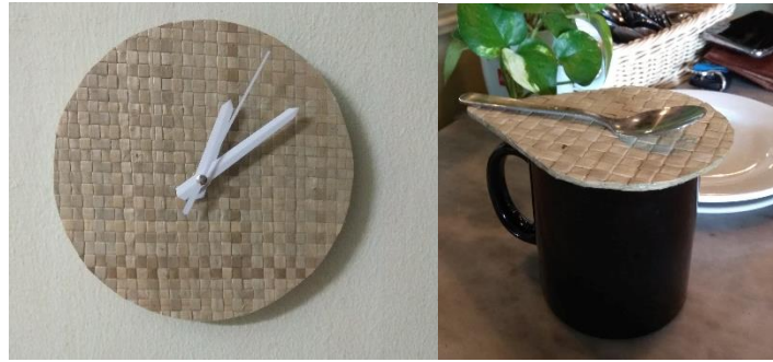
Figure 4 Clock and coaster design of woven screw-pine leaves bio-composites

Figure 4 shows the clock and coaster design that using the woven screw-pine leaves bio-composites with different numbers of layers. The clock design is using a triple layer while the coaster is using only double layers. The differences of number of layers are due to the products that needed certain stage strength.