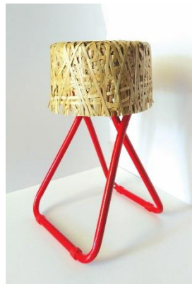
Figure 2 Stool made of screw-pine leaves bio-composite

Four designs that demonstrative different type of sector is design. A stool is indicated the furniture industry, the lighting design and two small product design of clock and coasters.