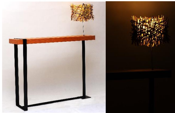
Figure 3 Lighting features made of screw-pine leaves bio-composite

Figure 2 shows the stool design that made of screw-pine leaves bio-composite. The application of the screw-pine leaves bio-composite in this design is produced by using molded cold press method. The implementation of screw-pine leaves in furniture design is an approach to introduce the screw-pine leaves new product line.