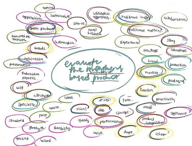
Figure 1 The record during the discussion using KJ Method

Implementing KJ methods are a process and technique of discussion that highlights subjective and qualitative data priorities (Spool, 2004) 8 . The attributes requirement in the survey is the focus characteristic that used to validate the application of screw-pine leaves bio-composite in product designs.